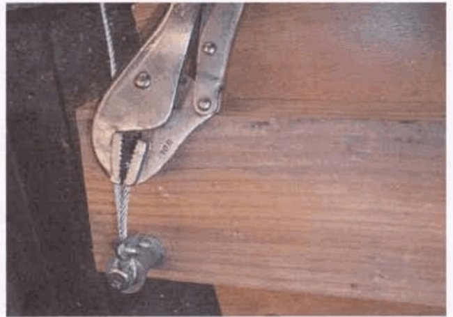
12. Pull taunt through U-bolt and Tighten U-bolt. Finish by tightening lag bolt.