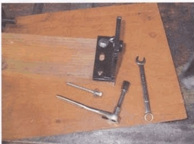
3. Using lag screws, attach both brackets to mounting surface. Back out all lag screws 1/2"-1".