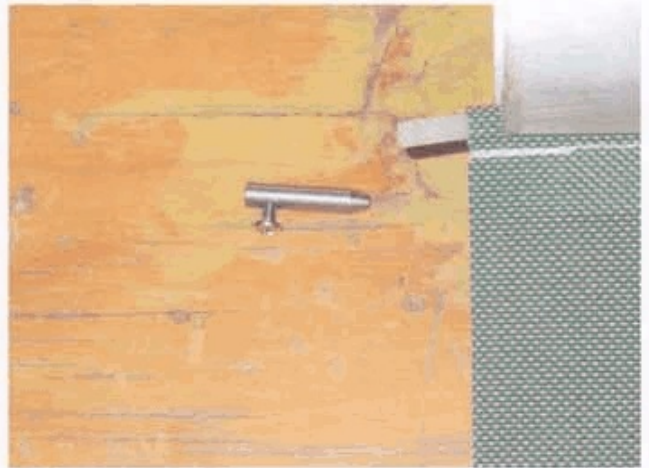
5. One fabric lock goes in end of each roll drop. Plastic welt needs to be trimmed off and pulled