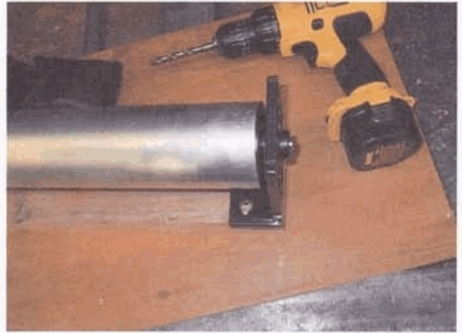
4. Attach brackets to mounting surface w/lag screws and washers.