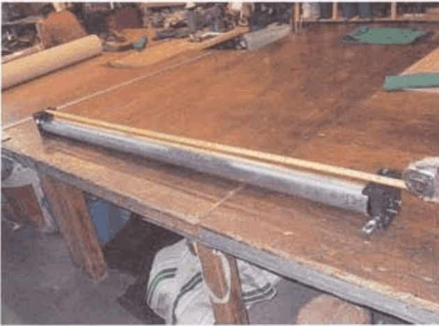
1. Assemble brackets & gear to tube. Measure hole to hole. Transfer this number to mounting surface.