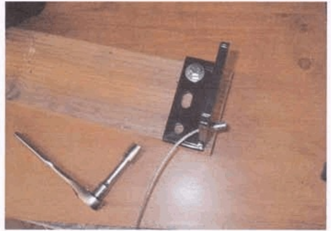
10. Ultimately, cables must be pulled tightly to align w/eye ends on pipe.