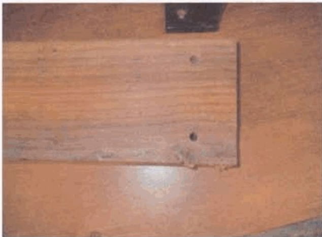
2. Pilot holes w/1/4" drill bit.