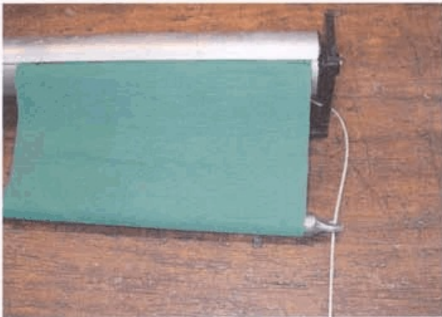
8. Install pipe. Find the combination that will allow bottom pipe w/eye ends to slide up and down freely. This is critical.