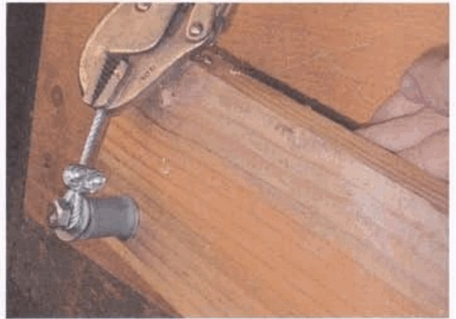
11. Pull guidewire to where you want to mount bottom of cable. W/tiny drill bit find framing inside wall (studs/bottom plate). Pre-drill 1/4". Lag screw-still loose.