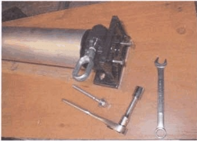
7. W/fabric on tube, spread loose brackets to receive tube+gear. W/10mm bolts, mount gear to accomodate hand crank.